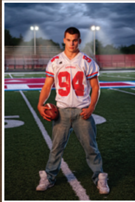
before & after