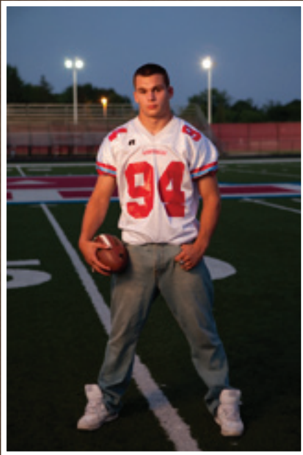
before & after